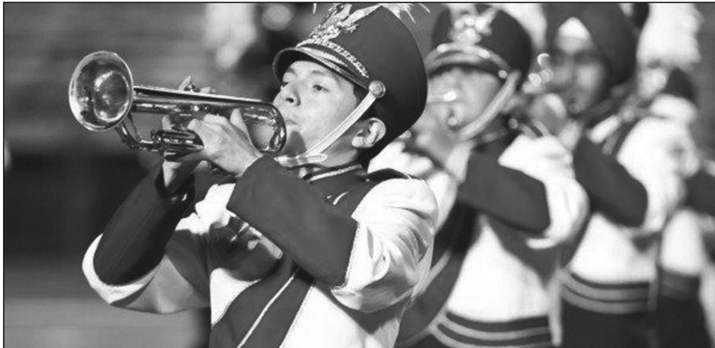
THE TIGER REGIMENT WILL GO TO HAWAII DURING THEIR SPRING BREAK.

The Valencia Band and Color Guard are very privileged to be able to make the trip, and based on the performances we have seen at home, will be sure to make a lasting impression on those residing in and visiting Hawaii.